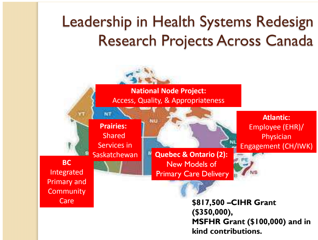
Figure 1: Six Node Health Leadership Case Study Projects

In addition to the research itself that aimed to understand leadership in action, there were also the twin goals of: